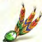
Silph Wing Teleports you back to the town.